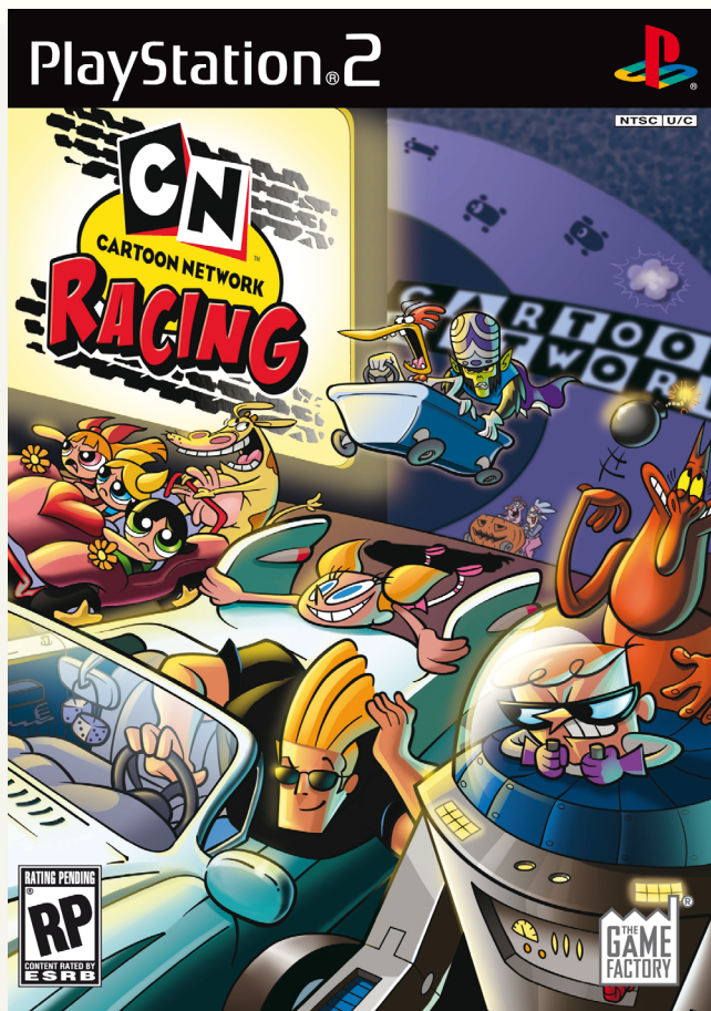
© Cartoon Network. TM & © Warner Bros. Entertainment, inc.